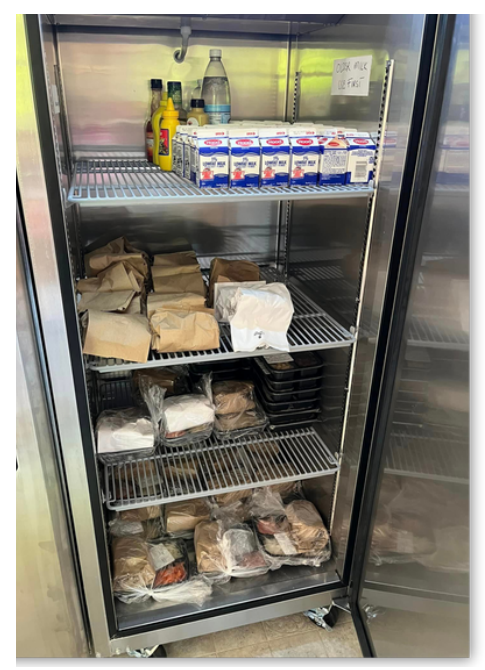
The award to Putney Community Cares helped them purchase a new fridge.

With the funding we established a community-led Steering Committee, who developed an RFP (Request for Proposals) based on the problem statement, and then selected organizations whose proposals aligned. Nine local organizations were selected out of a total of 15 applicants and a total of $168,000 was awarded through our "Community Resilience Grant". The awardees go as follows: